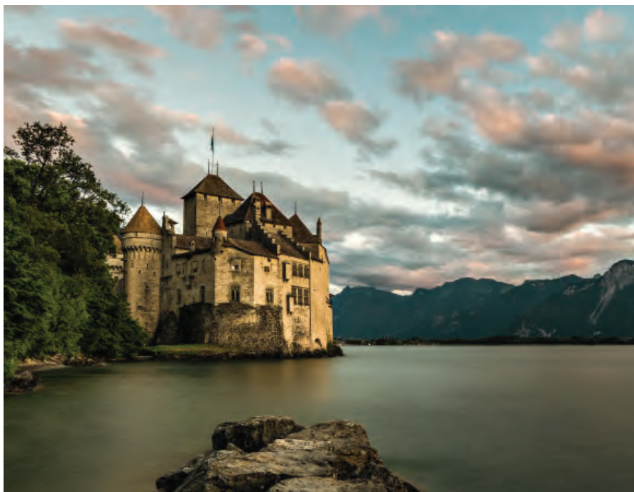
Chillon Castle, Lake Geneva

Travel via some of the most scenic and charming rail routes in Europe, passing forested valleys, Alpine meadows, sublime lakes, and historic old towns. This romantic touring holiday takes you from Lake Geneva, down into Mediterranean-style Ticino, back up to Lake Lucerne, and then into the lush countryside of the Saanenland.