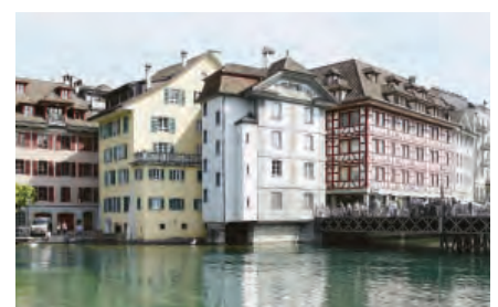
Hotel Wilden Mann, Lucerne

Hotel Wilden Mann has been hosting guests for over 500 years; first as a bar, then as a tavern, and now as a luxury hotel. Inside, the original winding corridors and traditional elements remain, adding further quiriness to the building that clings to the edge of the river. The lovingly decorated rooms have antique furnishings, abundant character, and a very classical style.