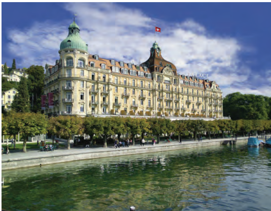
Palace Luzern, Lucerne

Just a short walk from Gstaad's main boutiques, cafes, and restaurants, Le Grand Bellevue is a highly convenient hotel immersed in the picturesque lifestyle of the Saanenland. Its pale yellow façade is palatial in design, with a distinctive tower that shapes some of the hotel suites. Equipped with a Michelin starred restaurant and an indulgent spa, this is a luxurious property in which to spend two or three nights while you explore the Saanenland.