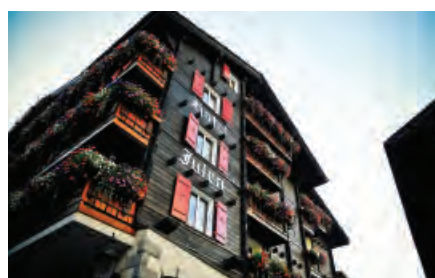
Romantik Hotel Julen, Zermatt

A history, chic property, the Grand Hotel Zermatterhof may well be the most prestigious hotel in Zermatt. Positioned in the centre of the village, it is just a minute's walk from the main church, a park, the best restaurants in Zermatt, and the Matter Vispa. The rooms blend state-of-the-art comfort with regal charm.