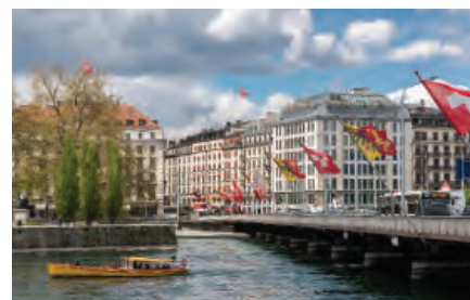
Hotel Bristol Geneva