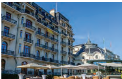
Hotel Beau Rivage, Geneva