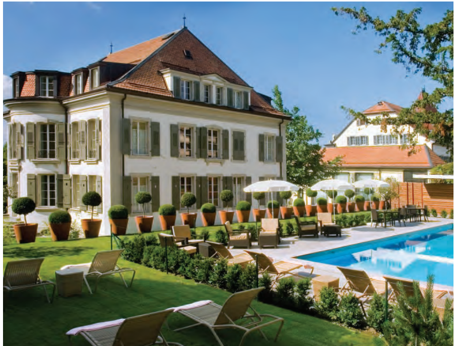
Hotel Angleterre et Residence, Lausanne

This elegant spa hotel has a stunning, palatial façade, beautifully grand, ornate rooms, and convenient tennis facilities. Diverse internationally-inspired dining options provide plenty of indulgent options for evening meals. From the outdoor pool, guests can see Lake Geneva, and the mountains on the other side. This hotel is just a short walk from Ouchy Harbour.