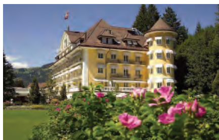
Le Grand Bellevue, Gstaad

This luxurious property on the banks of Lake Geneva has its own Michelin-starred restaurant, a Thai restaurant, regal bedrooms, and an enviable location in the city. On the outside, French balconies are decorated with blue flowers, and inside an authentically recreated Roman atrium provides a wholly unique place to relax.